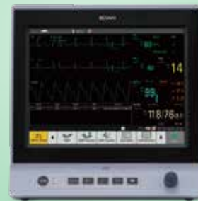
X series Patient Monitor